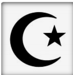
The Crescent Moon