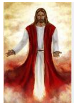
Jesus Christ (33 AD)