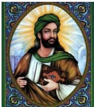
Prophet Muhammad (570-632 AD)

No additional revelation. No additional books added to the Bible.